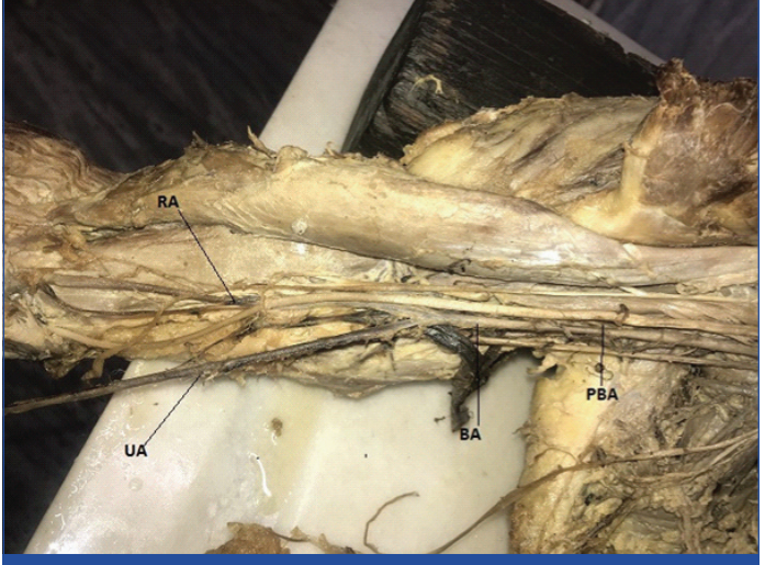
[Table/Fig-5]: Shows right sided- BA- Brachial Artery giving off the, PBA- Profunda brachii artery and high division of the ulnar artery (UA) and radial artery (RA).