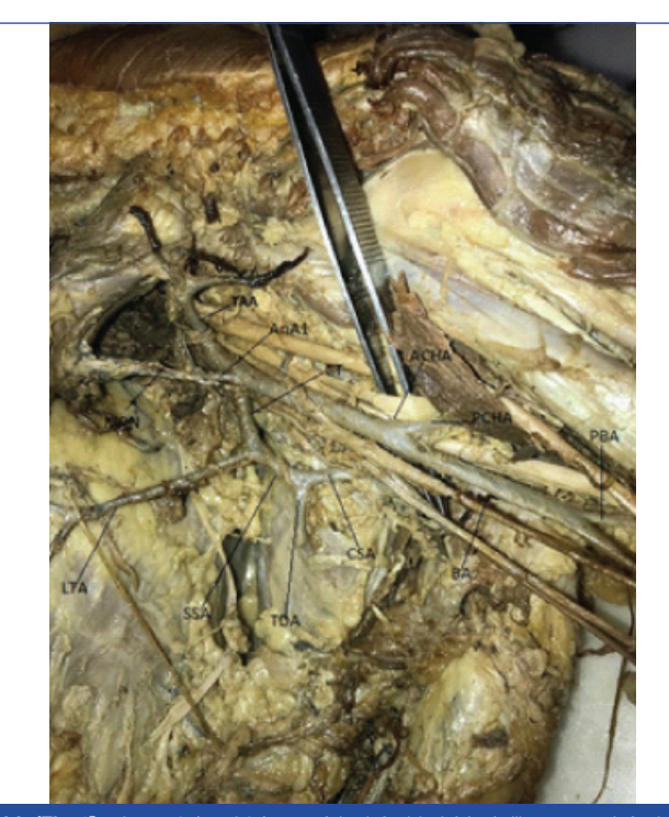
[Table/Fig-1]: shows 2<sup>nd</sup> and 3<sup>rd</sup> part of the left sided AA- Axillary artery. It further divides into TAA- Thoracoacromial artery, AnA1- Artery running with the medial pectoral nerve (MPN), CT- Common trunk which gives the LTA-Lateral thoracic artery and SSA-Subscapular artery (further dividing into TDA- Thoracodorsal artery and CSA- Circumflex scapular artery). The PCHA- Posterior circumflex humeral artery, ACHA- Anterior circumflex numeral artery arise from the 3<sup>rd</sup> part of the axillary artery. The BA- Brachial artery and its branch, PBA- Profunda brachii artery can been seen.

A common trunk for the posterior circumflex humeral artery and the