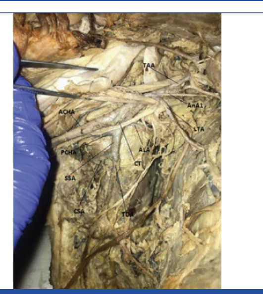
[Table/Fig-4]: Show shows 2<sup>nd</sup> and 3<sup>rd</sup> part of the right axillary artery. Its 2<sup>nd</sup> part divides into TAA- Thoracoacromial artery, LTA- Lateral thoracic artery, AnA1- Artery proximal to LTA and a CT- Common Trunk which gives the PCHA- Posterior circumflex humeral artery, SSA- Subscapular artery and ALA- Alar artery. The 3<sup>rd</sup> part gave off ACHA- Anterior circumflex humeral artery. The terminal divisions of the subscapular artery (SSA), i.e., Thoracodorsal artery (TDA) and circumflex scapular artery. (CSA) can be seen.

[Table/Fig-3]: Shows left sided- BA- Brachial Artery giving off the, PBA- Profunda brachii artery and proximally dividing into UA- Ulnar artery and RA- Radial artery.